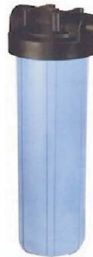
20" "Big Blue" Style Polypropylene Filter Housing with Pressure Relief Valve & 1" or 1.5" inlet/outlet connections